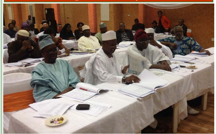
Some Past Presidents of NSE at the Council Meeting